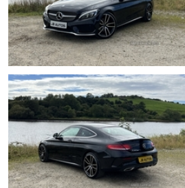
Just Fully Serviced TomInclude New Discs And Pads, Sold With Full Years MOT!

Optional Extra New Alloys And New Tyres - £945 **Viewing By Appointment Only**